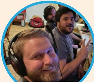
Playing video games with our brothers