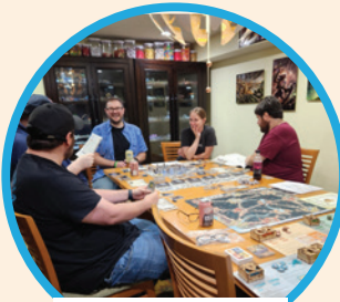
Board games with friends