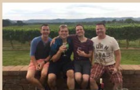
Winery afternoon out with friends