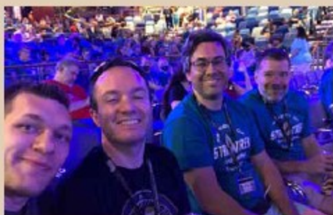
Star Trek Cruise IV with friends